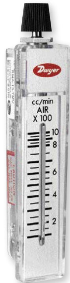
Model RMA-TMV 2" scale, 4-13/16" high